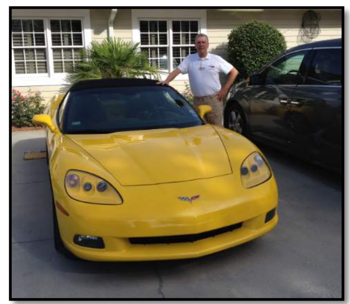
The red ones are OK, too.