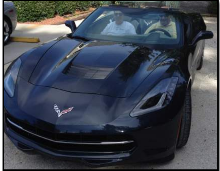
Great cars, huh?